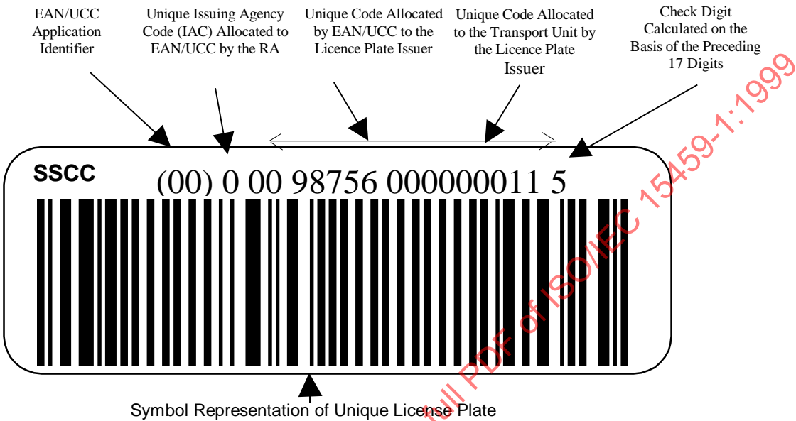
Figure B.1 — Unique identification (license plate) in the EAN/UCC-128 bar code symbology with the EAN/UCC Application Identifier “00” and human readable interpretation

The bar code above, when scanned, would be expected to pass the following data string to the computer system: