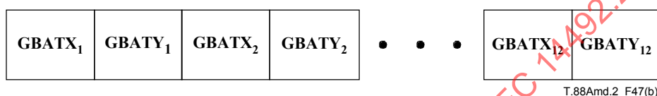
Figure 47(b) – Generic region AT flags field structure when GBTEMPLATE is 0 and EXTTEMPLATE is 1

c) New Figure 47(b) is inserted immediately after as follows: